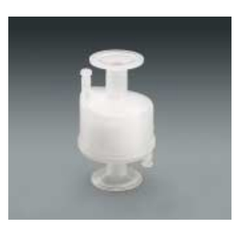
Type SS, with sanitary flange inlet and outlet