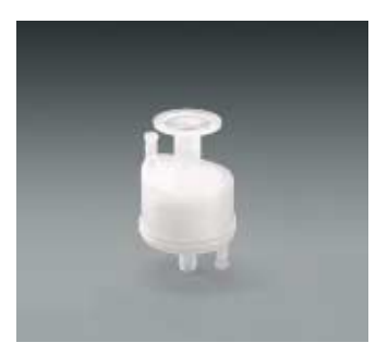
Type SO, with sanitary flange inlet and hose nipple outlet