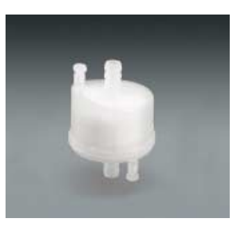
Type 00, with hose nipple inlet and outlet