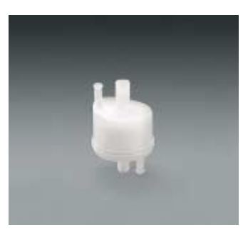
Type RO, with G3/8 male thread inlet and hose nipple outlet