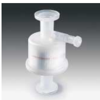
Sartobran 150 (type SS)